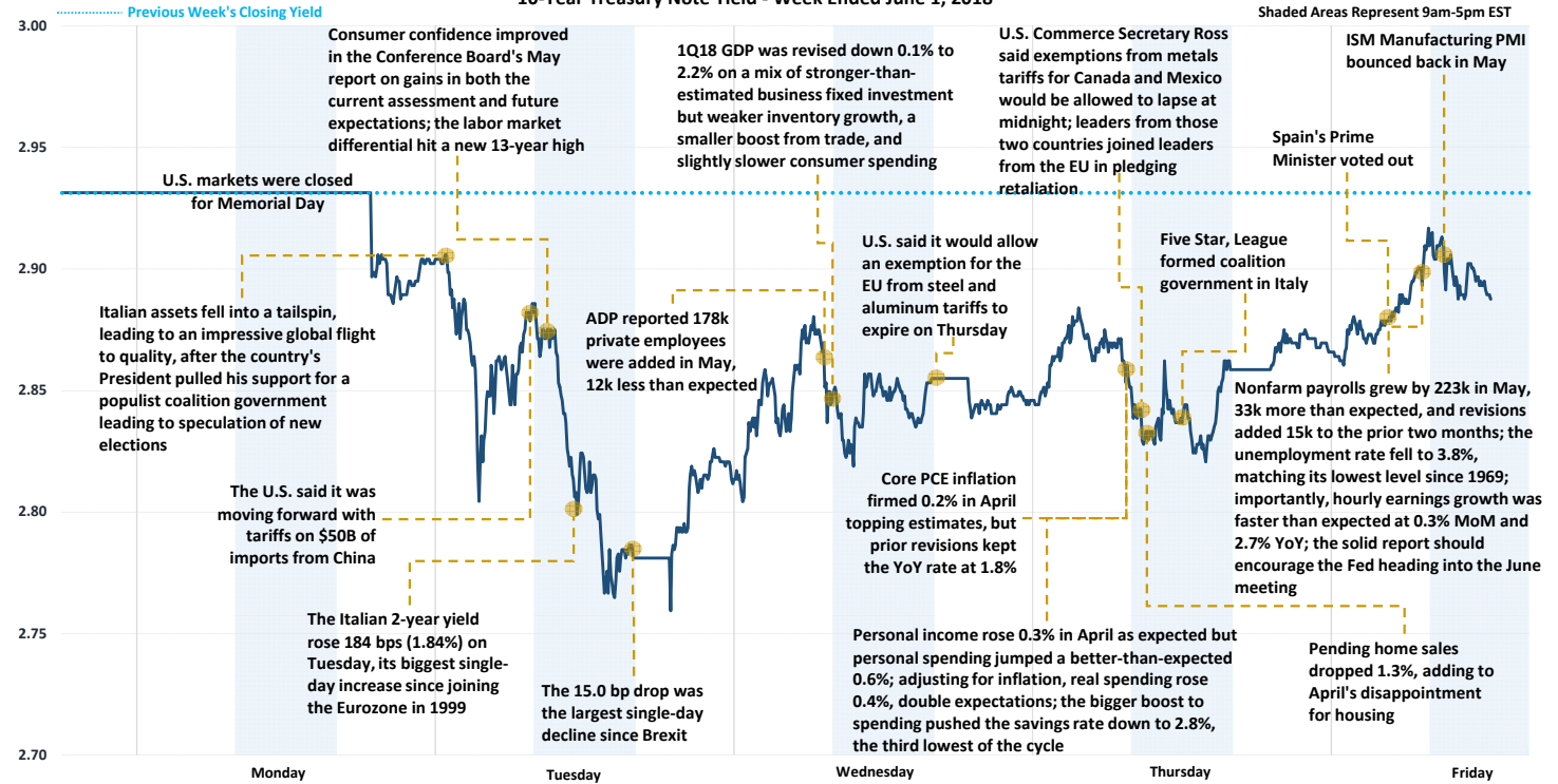
Treasury Curve Week-Over-Week

Record-High Nasdaq Close ★ Record-High S&P Close ★ Record-High Dow Close ★ 10-Year Treasury Note Yield - Week Ended June 1, 2018